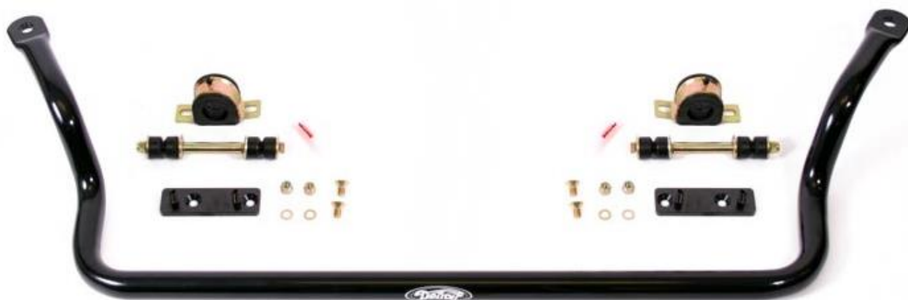
Figure 1 - Part Number 031402 Shown

The Detroit Speed, Inc. Front Tubular Anti-Roll Bar is designed to address the shortcomings of the small factory F-Body and A-Body Anti-Roll bar. The DSE Anti-Roll bar kit comes with greaseable polyurethane bushings, mounts and end links. Testing revealed a dramatic improvement on cars with stock suspension and optimal improvement on cars fitted with other DSE components.