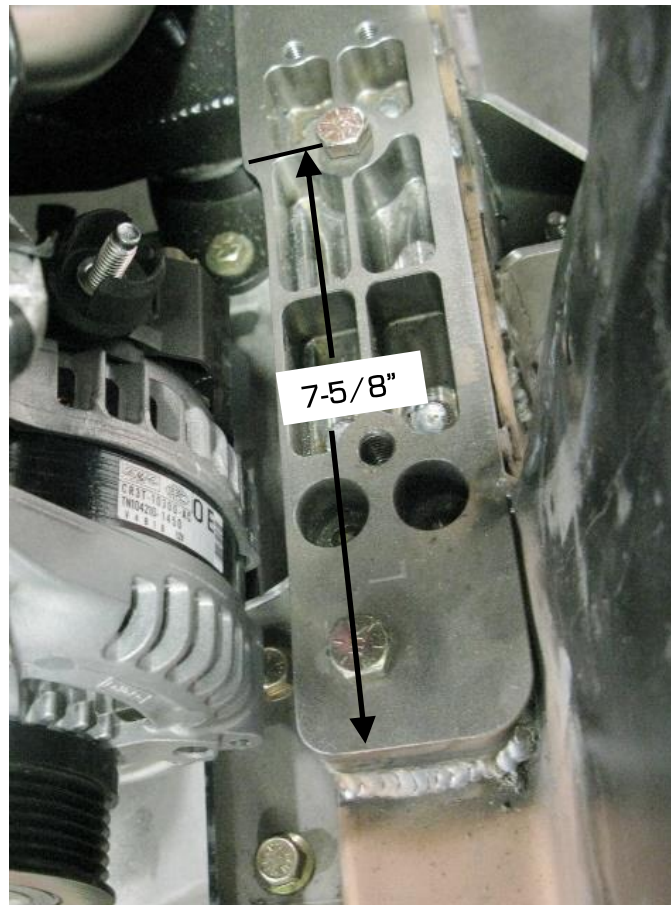
Figure 1 - Modify Framerrail Adapter