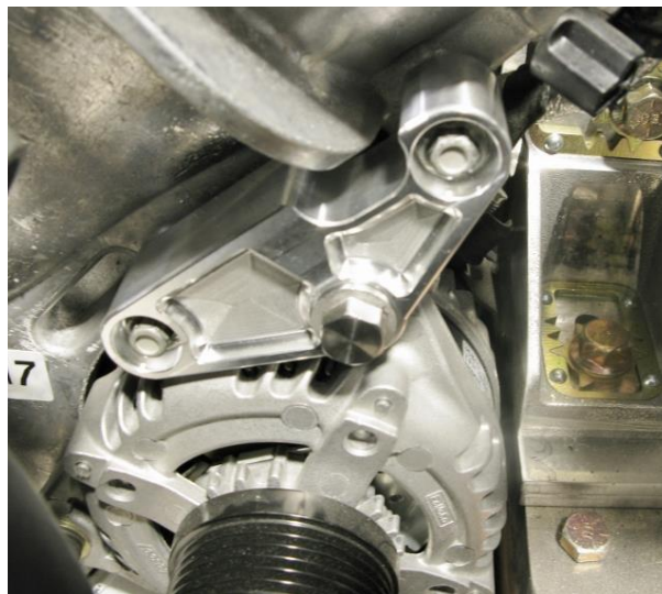
Figure 6 – Install Relocation Bracket

If you have any questions before or during the installation of this product please contact Detroit Speed at tech@detroitsspeed.com or 704.662.3272