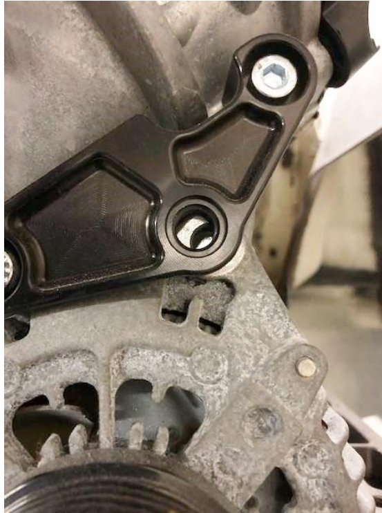
Figure 5 – Test Fit Alternator