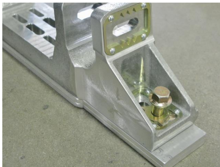
Figure 2 - Modify Upper Control Arm Bracket & Shims