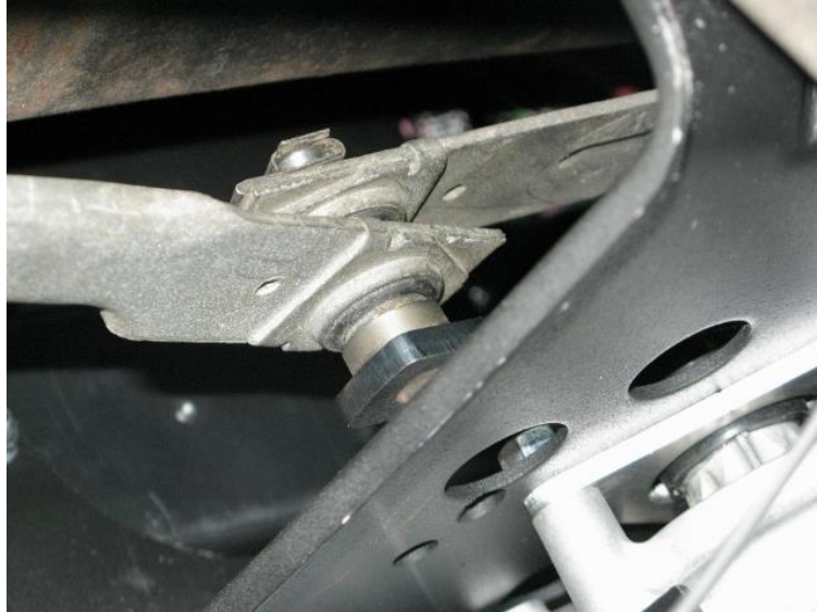
Figure 6 - Attach Wiper Linkage to Pitman Arm