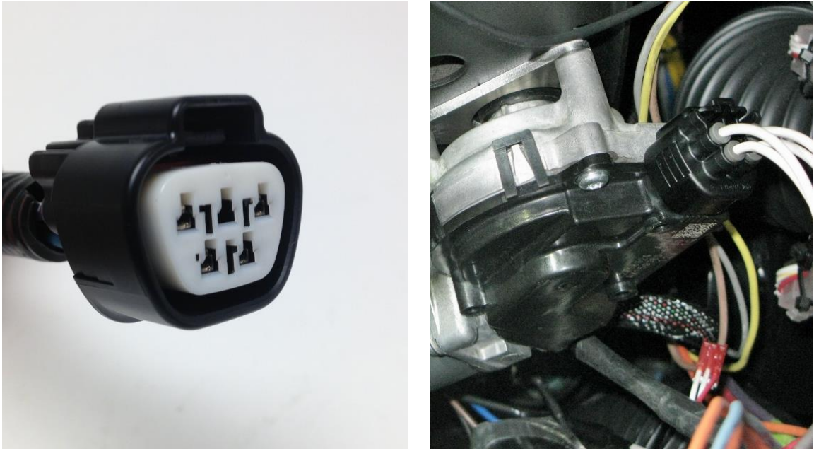
Figure 8 - Wiper Motor Connector