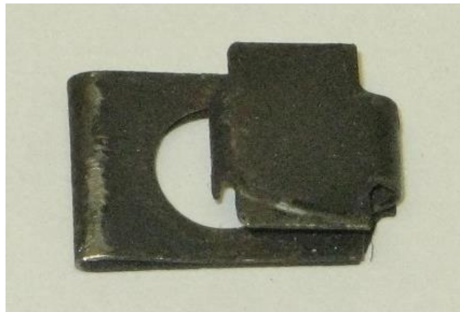
Figure 1 - Retaining Clip