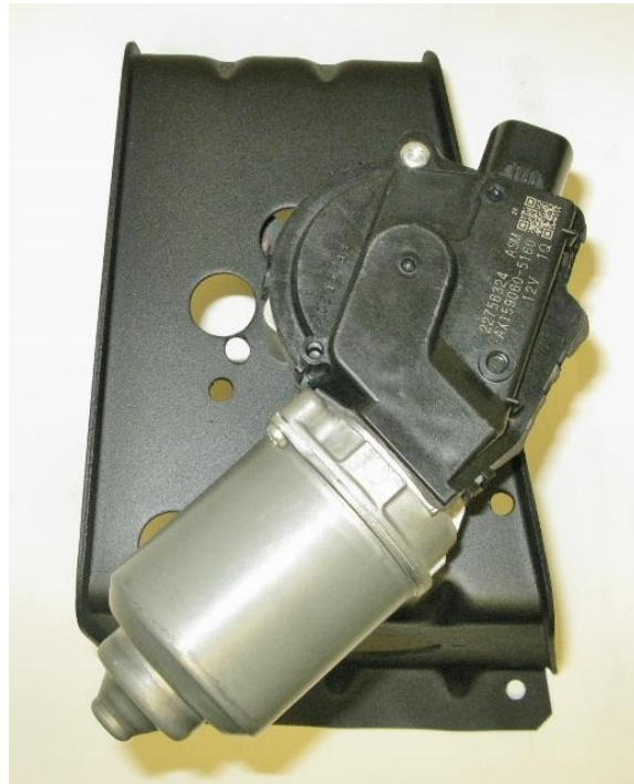
Figure 4- Wiper Motor