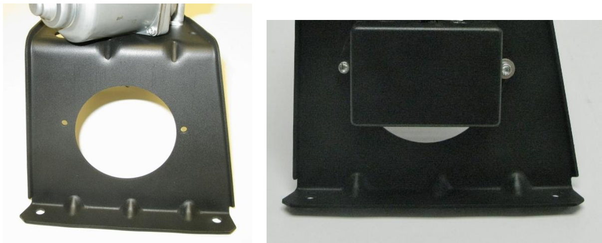
Figure 5 - Mount the Wiper Control Module