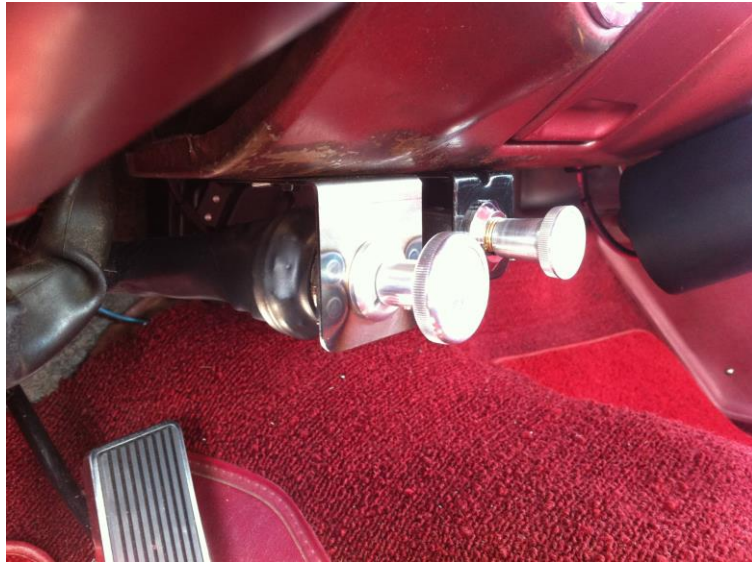
Figure 7 - Wiper Switch