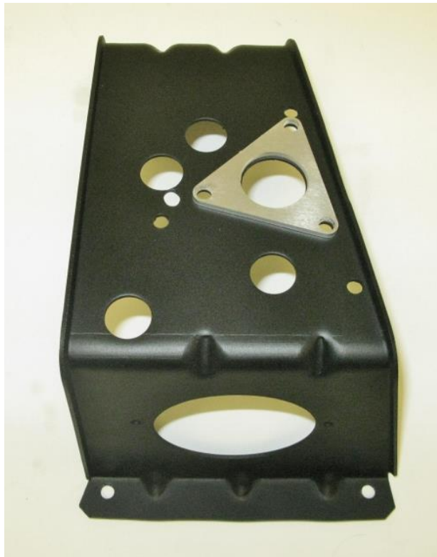
Figure 3 - Wiper Motor Spacer