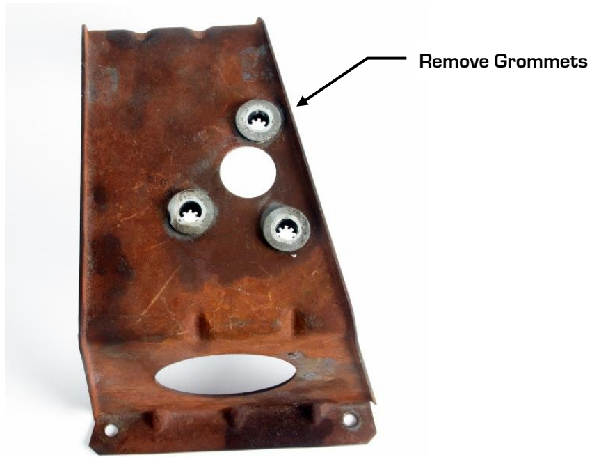
Figure 2 - Factory Wiper Motor Mounting Bracket