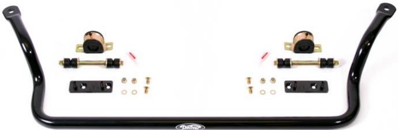
Figure 1 - Part Number 031402 Shown

The Detroit Speed, Inc. Front Tubular Anti-Roll Bar is designed to address the shortcomings of the small factory F-Body and A-Body Anti-Roll bar. The DSE Anti-Roll bar kit comes with greaseable polyurethane bushings, mounts and end links. Testing revealed a dramatic improvement on cars with stock suspension and optimal improvement on cars fitted with other DSE components.