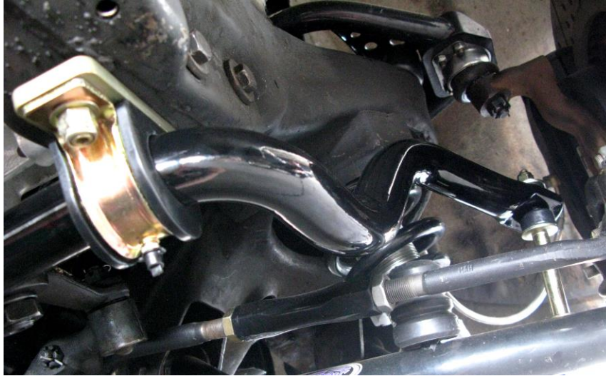
Figure 4 – Completed Installation

If you have any questions before or during the installation of this product please contact Detroit Speed Inc. at info@detroitsspeed.com or 704.662.3272