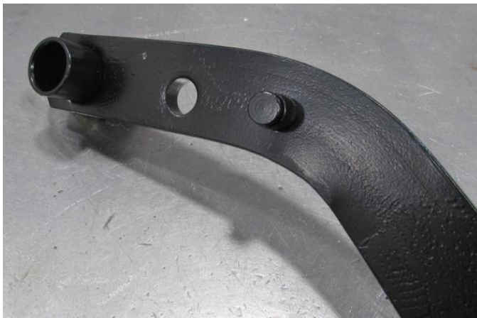
Figure 2a - Remove Pedal Stud