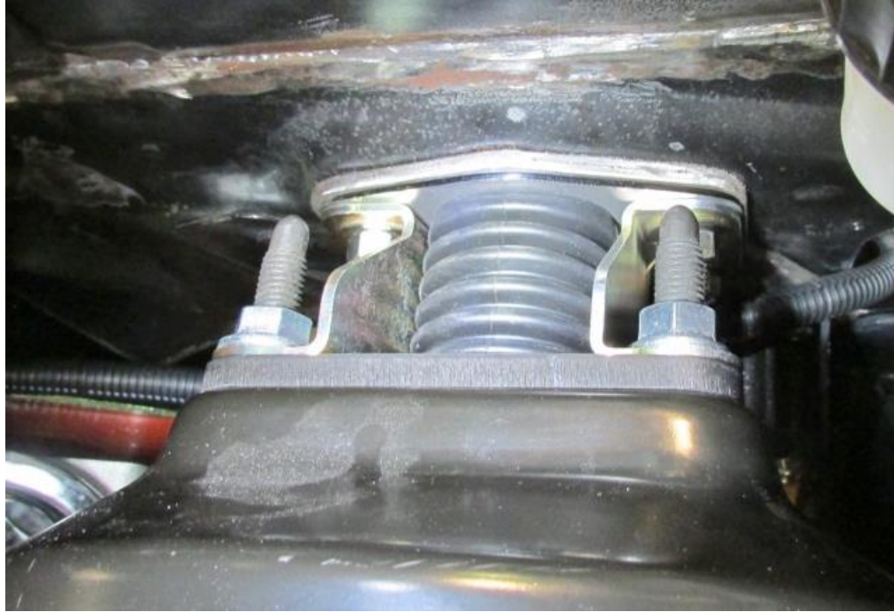
Figure 1 - Install Brake Booster/Master Cylinder to Firewall