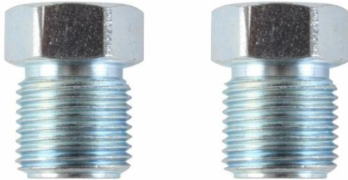
Figure 3 - Brake Master Cylinder Fittings