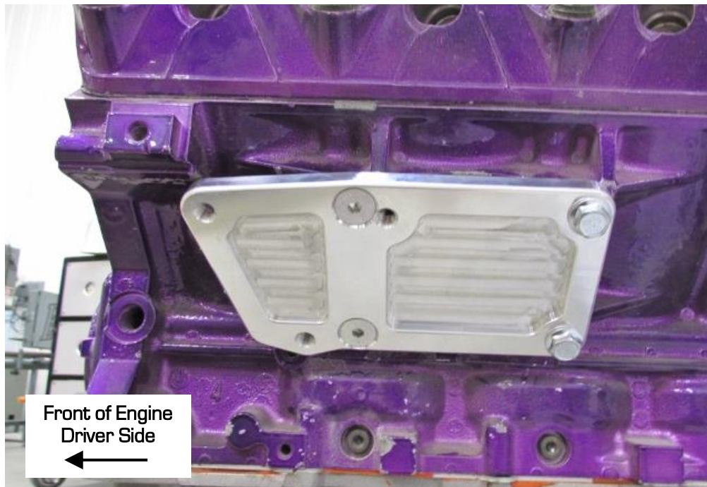
Figure 1 - Install Adapter Plate