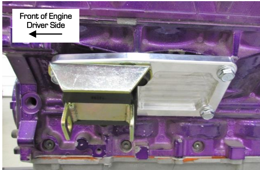
Figure 2 - Install Engine Mount