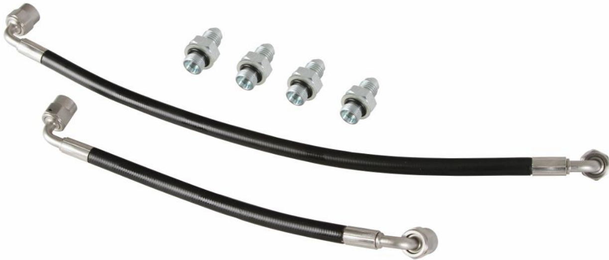
Figure 1 - P/N 091307 shown

The DSE rack & pinion fluid transfer conversion kit will replace the hardlines on your DSE rack & pinion using -4 AN steel fittings. The hoses are Teflon lined to handle the high pressure demands of the steering system and come with pre-crimped stainless steel fittings to attach to the -4 AN fittings.