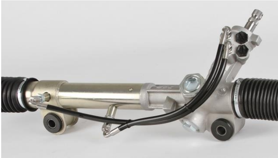
Figure 3 – Secure Fluid Transfer Hoses