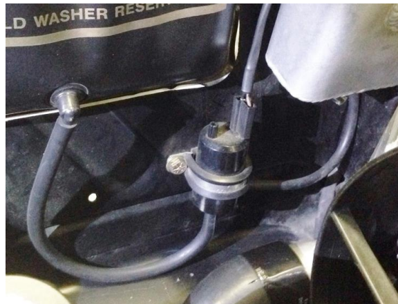
Figure 2 – Install Washer Pump