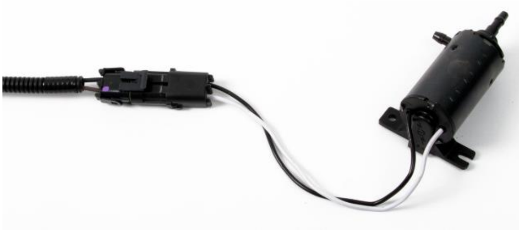
Figure 4 - Connect the Weather pack connectors