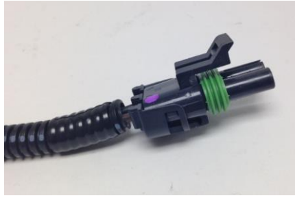
Figure 1 – Washer Pump Connection