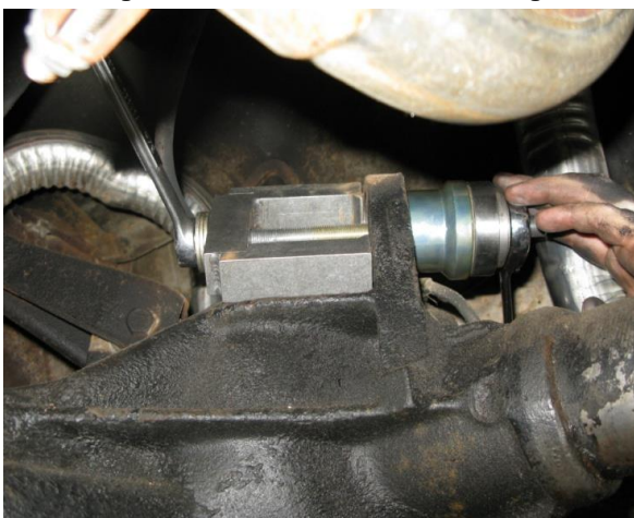
Figure 2 - Installation of the Axle Bushing